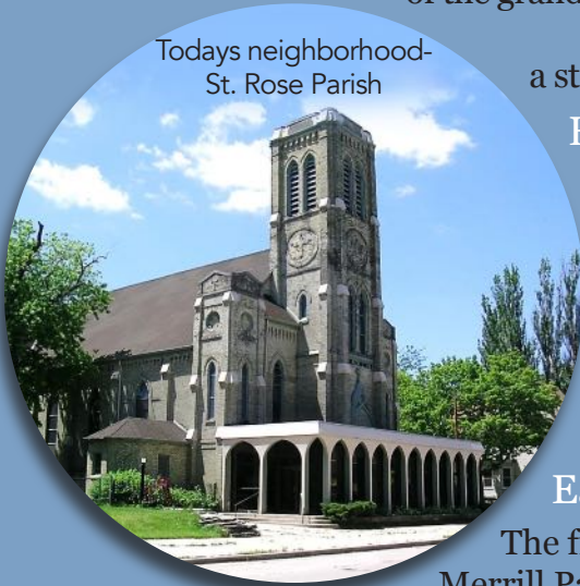
Today's neighborhood— St. Rose Parish

Pub life was an import from rural Ireland, with a few new twists. In Ireland, English limits on industrialization and restrictions on the kinds of crops Irish farmers could raise helped create a society in which marriage of the offspring was delayed to provide manual labor for the farm,