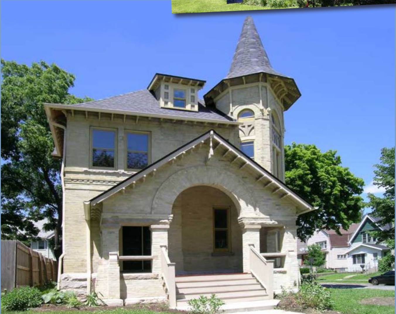
Today's neighborhood-Example of ornate home in the Merrill Park neighborhood