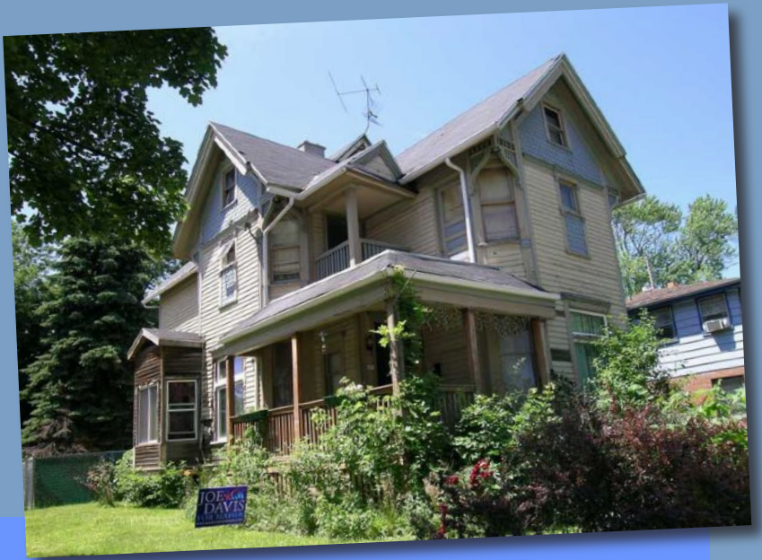
Today's neighborhood- Example of large home in the Merrill Park neighborhood