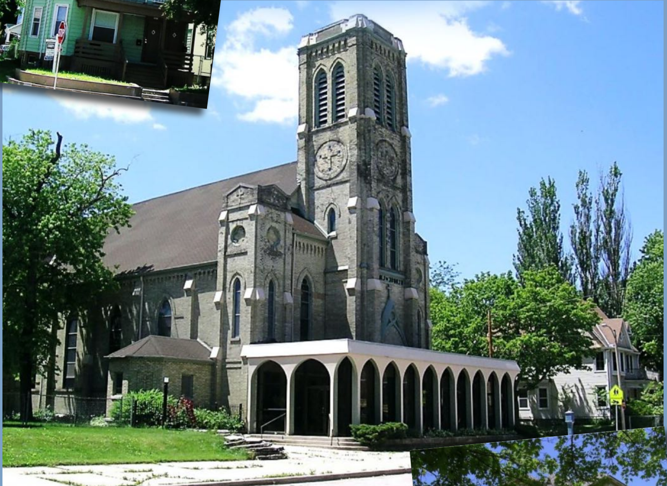
Today's neighborhood - St. Rose Parish