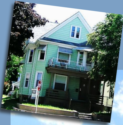
Today's neighborhood - Spencer Tracy's childhood home